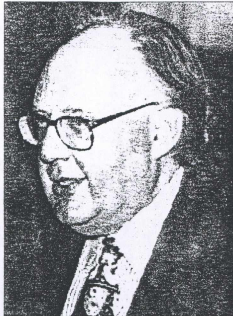
Greek Foreign Minister Theodoros Pangalos