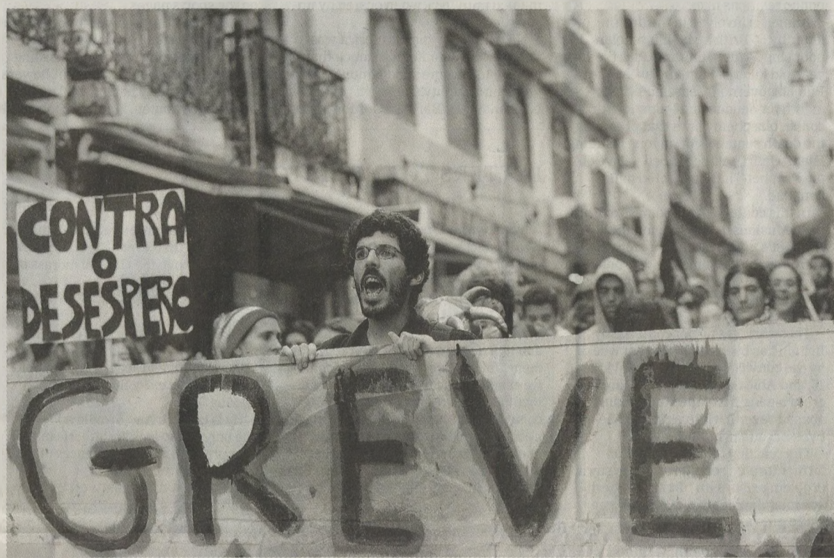
LISBON On Nov. 24, the first general strike in more than two decades followed government cuts.

So will Europe's strong nations let that happen? Or will they accept the responsibility, and possibly the cost, of being their neighbors' keepers? The whole world is waiting for the answer.