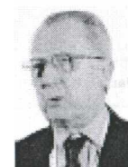
Jacques Delors Founding President of Notre Europe, European Commission President 1985-1995

One year ago, the PES decided to launch a new initiative: the New Social Europe.