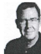
Poul Nyrup Rasmussen PES President, Prime Minister of Denmark 1993-2001